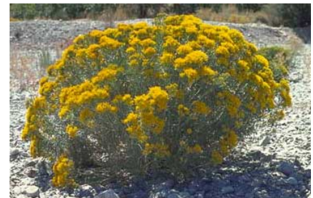
Ericameria nauseosa