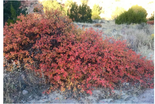
Rhus trilobata - Photo by Irene Shonle

Stress the lawn & plant native shrubs – Mow the lawn very short and stop watering your lawn to drought-stress it. Plant native shrubs close enough together so that the mature size will create a continuous cover of shrubs. Water only the shrubs (not your lawn). As they grow bigger, they will provide shade to inhibit lawn growth underneath as well as provide food and shelter for birds and other wildlife. Some excellent, large, drought-tolerant native shrubs that will provide ecological value and winter interest are Three-leaf sumac ( Rhus trilobata ), Apache Plume ( Fallugia paradoxa ), Pawnee Buttes Sand Cherry ( Prunus besseyi ), and Rabbit brush ( Ericameria nauseosa ).