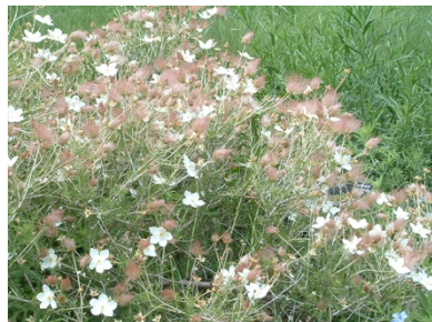
Fallugia paradoxa