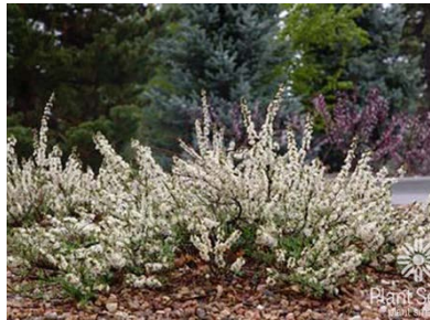
Prunus besseyi